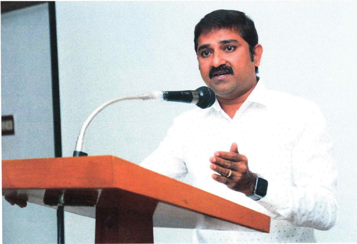
Keynote Address by Resource Person